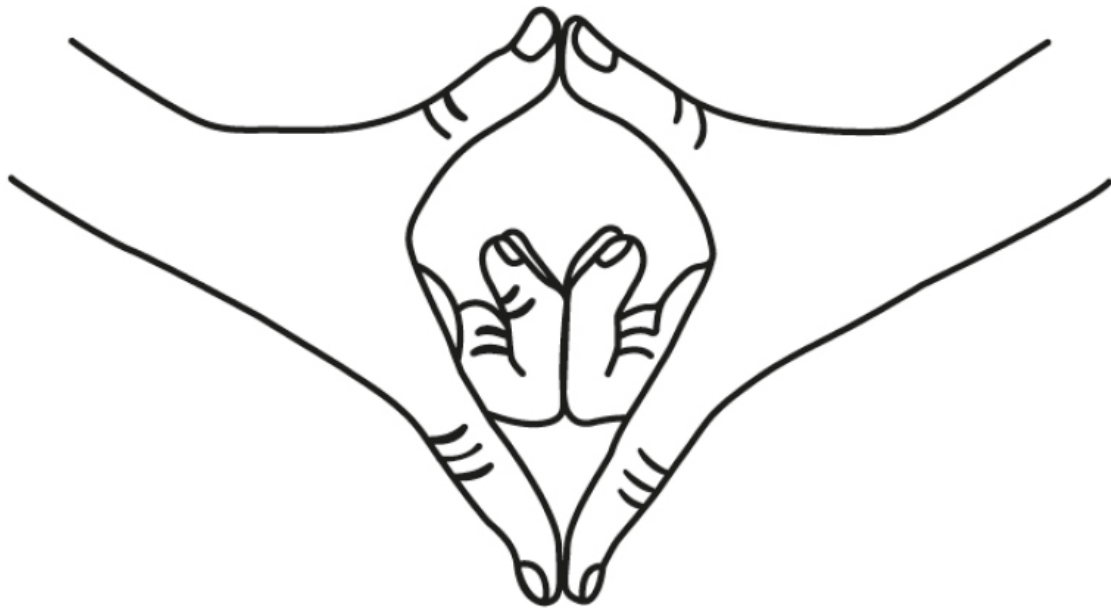
The Yoni Mudra

There's a very simple mudra that you can practise right now if you're raring to get started with connecting to the womb. It's called the Yoni Mudra. When practised, the fingertips fire up an energetic circuit to the womb.